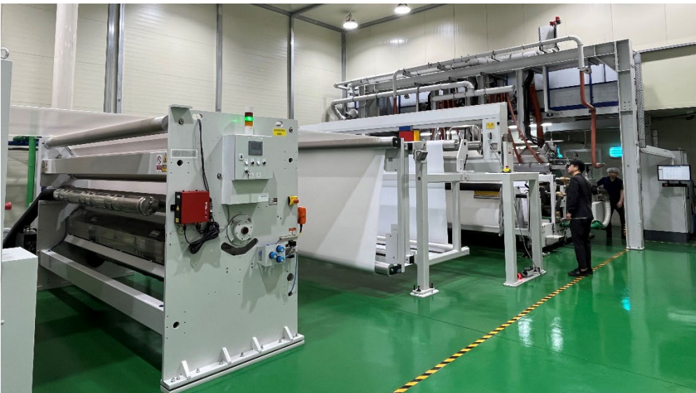
Reifenhäuser Value CPP 5-layer line at JaeKwang, one of the best-known packaging manufacturers in South Korea.