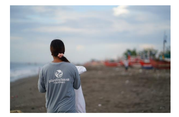
Image caption: Collecting plastic waste in the Philippines. The Plastic Bank concept ensures a clean environment, supports collectors and provides the industry with recycling material.